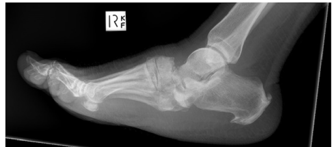
Xray of a Charcot foot pre operation

Surgery can be considered if the foot shape is at risk of ulceration and amputation. If you would like an opinion on this condition, please book an appointment with Dr Christy Graff.