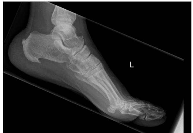
Xray of a normal foot