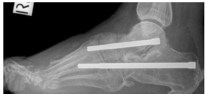
Xray of a Charcot foot post operation