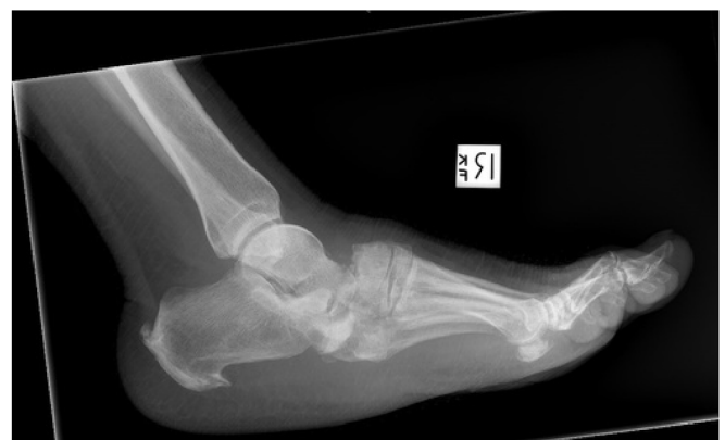
Xray of a Charcot foot